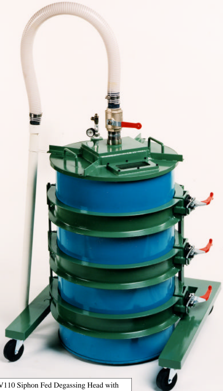
SV110 Siphon Fed Degassing Head with SV118 Rolling Drum Clamp Assembly